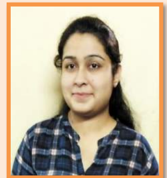
COMPILED BY: CA NISHA ATHWANI

UDIN generation has been made mandatory as per the Council Decision hence not generating UDIN for mandatory documents will amount to non-adherence of the Council Decision and may attract disciplinary proceedings as per the Second Schedule Part II of The Chartered Accountants Act, 1949.